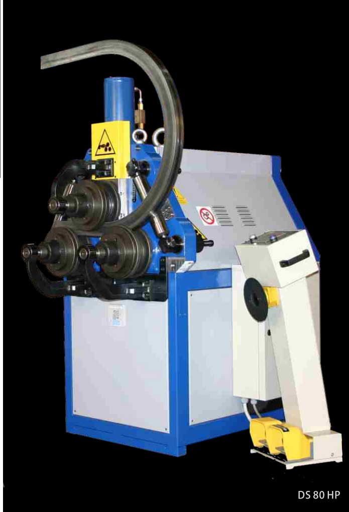
DS 80 HP