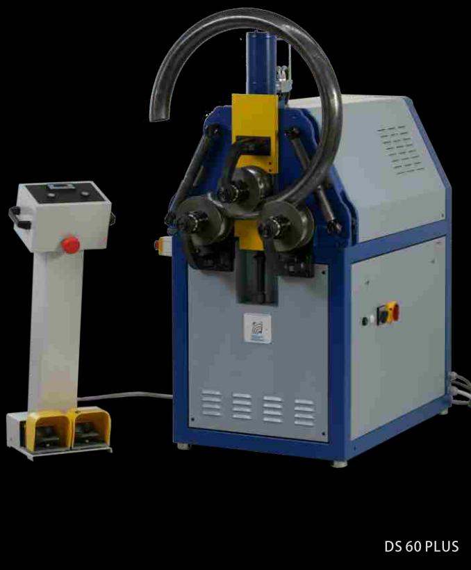
DS 60 PLUS